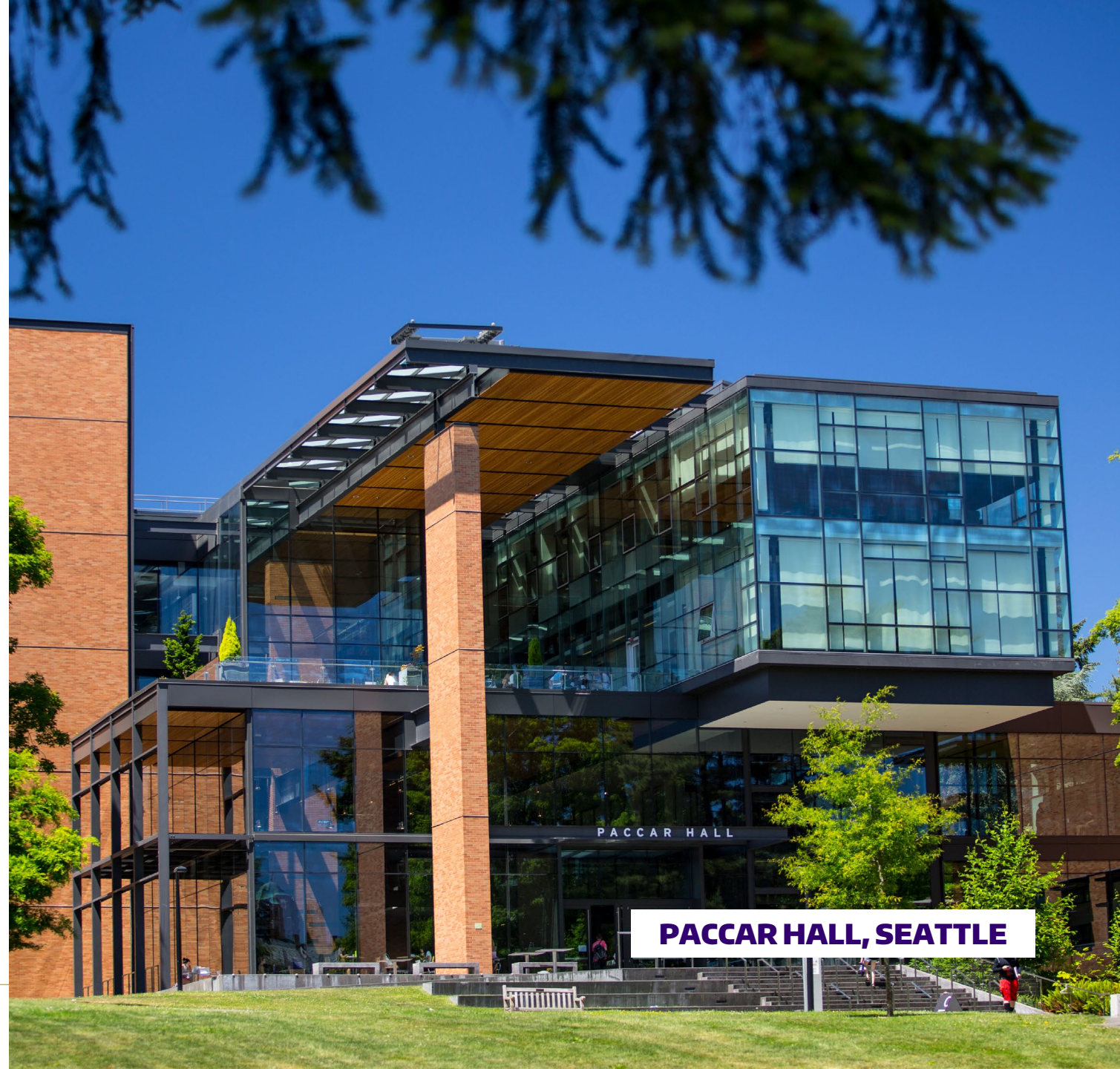
PACCAR HALL, SEATTLE

Learn from dynamic and engaging recorded material and engage in online discussions at a time that fits your schedule.