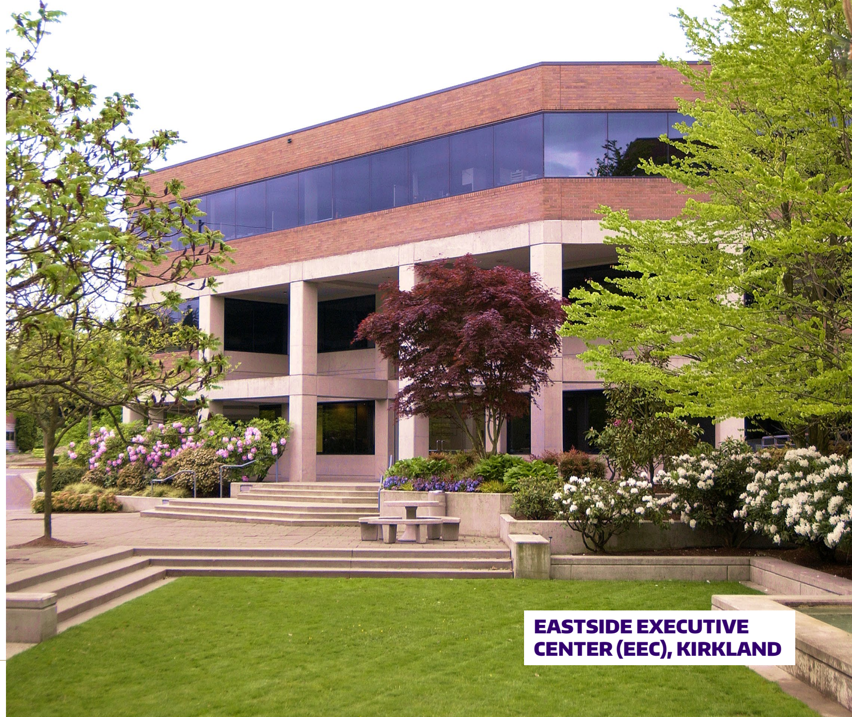
EASTSIDE EXECUTIVE CENTER (EEC), KIRKLAND