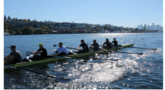
Members of the SFD ELA Cohort 5 rowing during their Kickoff session

Established in 2018, the University of Washington works in collaboration with local fire departments and services to create the Seattle Fire Department Executive Leadership Academy (SFD ELA) which was focused on providing leadership development for more senior leaders in the Fire Services in our region. The overarching goal of the SFD ELA is to develop the current and next generation of Fire Services leaders by creating a transformative learning and development experience for those who are ready and committed to advancing their own leadership development.