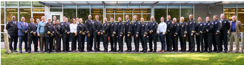
Members of SFD ELA Cohort 5 (2023-2024) during their Certificate Ceremony

Are you a Senior Leader in Fire Services?