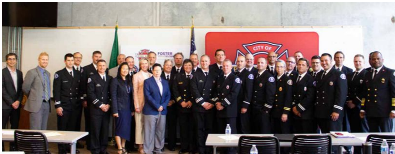
Members of the Inaugural Seattle Fire Department 2018-2019 Executive Leadership Academy

Overview: Established in 2018, the University of Washington works in collaboration with local fire departments and services to create the Seattle Fire Department Executive Leadership Academy (SFD ELA) which was focused on providing leadership development for more senior leaders in the Fire Services in our region. The overarching goal of the SFD ELA is to develop the current and next generation of Fire Services leaders by creating a transformative learning and development experience for those who are ready and committed to advancing their own leadership development.