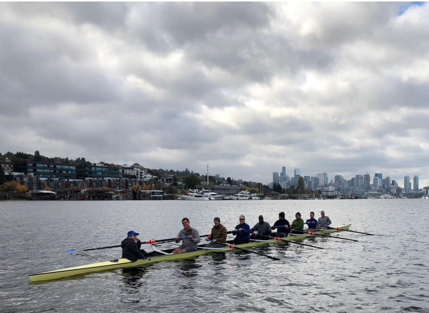
Members of the Seattle Fire Department Leadership Development Program during their kickoff crew session.