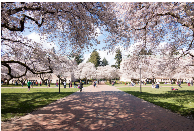
Cherry Blossoms at the UW Quad

Learn more about UW's Student Conduct Code .