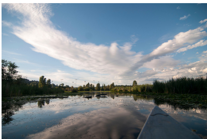
Lake Washington, Seattle

This interactive map can help you get acquainted with campus, and the greater Seattle area: http://www.washington.edu/maps/