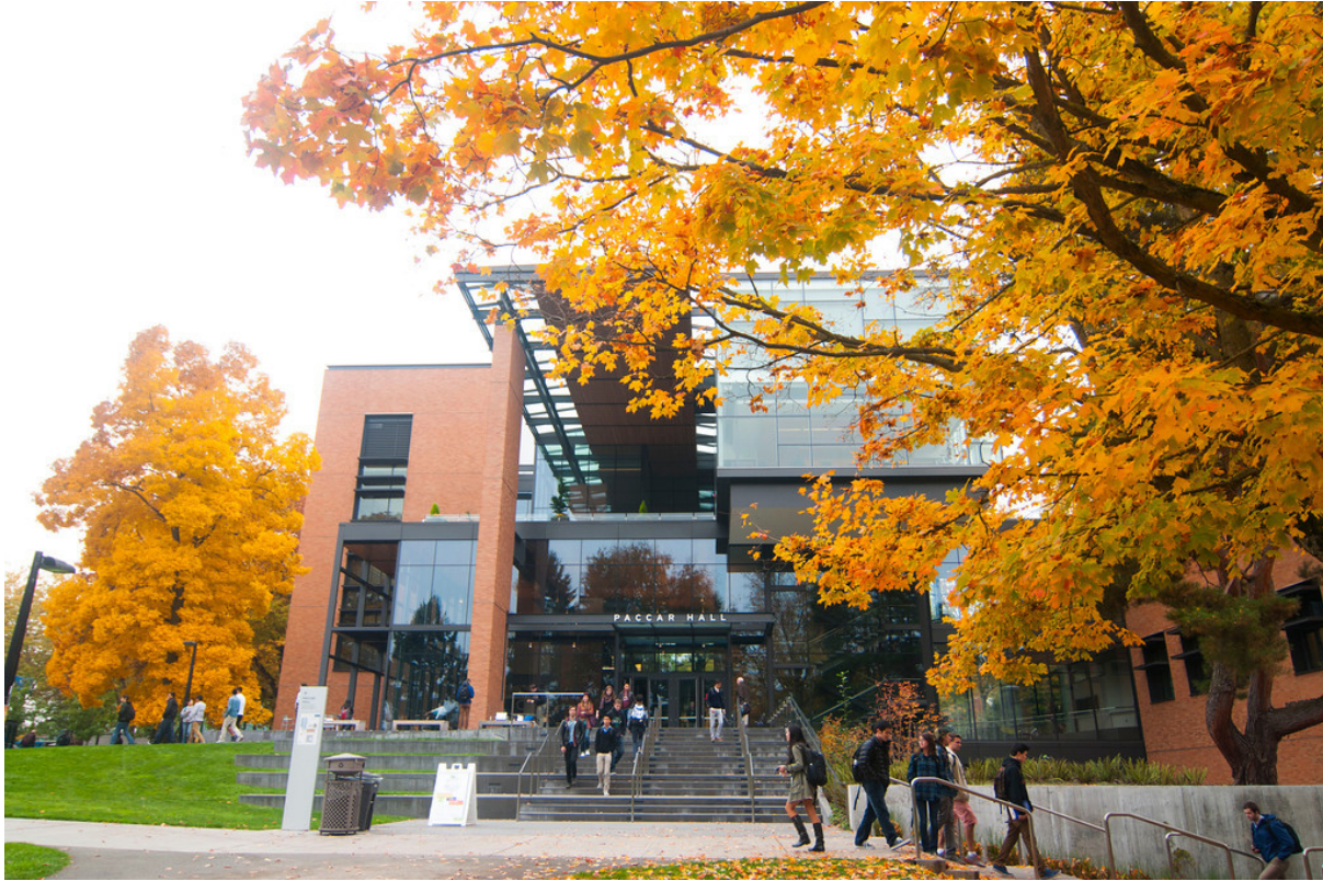
PACCAR Hall, home to the Foster School of Business