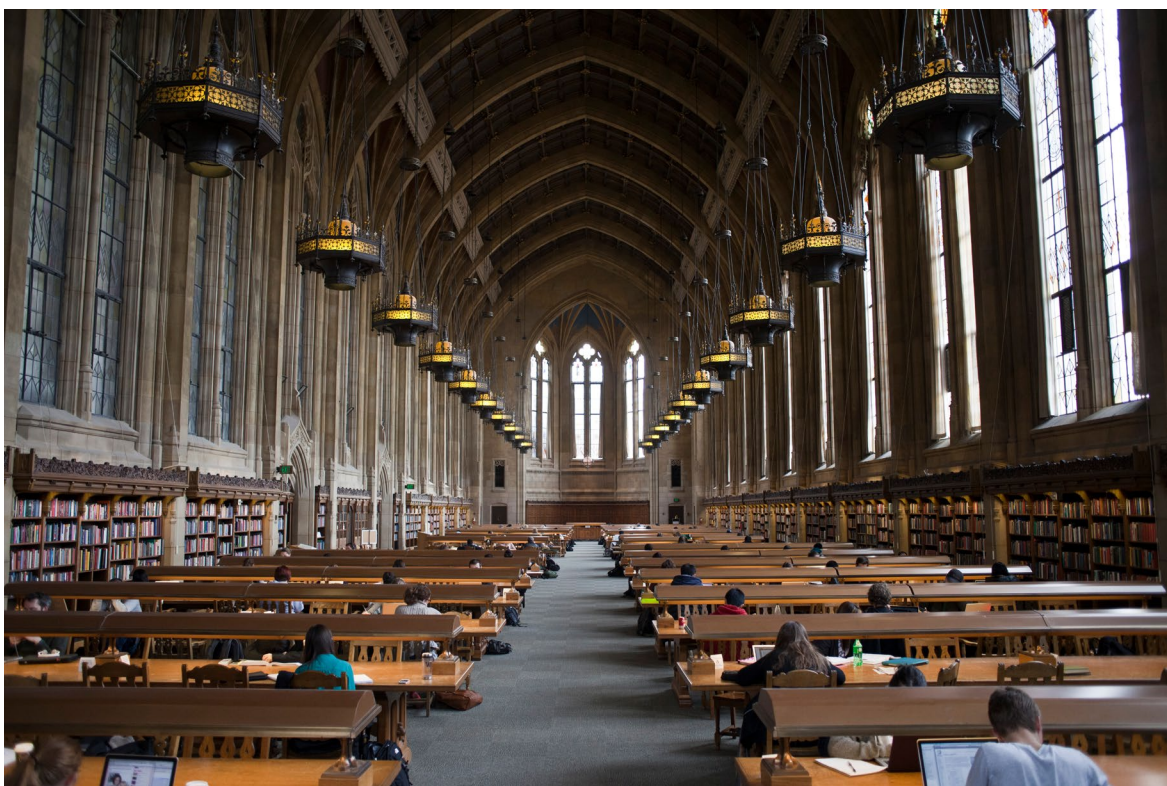
Suzzallo Library, University of Washington

The University of Washington is one of the world's preeminent public universities. Our impact on individuals, on our region, and on the world is profound — whether we are launching young people into a boundless future or confronting the grand challenges of our time through undaunted research and scholarship. Ranked number 13 in the world by Shanghai Jiao Tong University rankings and educating more than 54,000 students annually, University of Washington students and faculty work together to turn ideas into impact and in the process transform lives and our world.