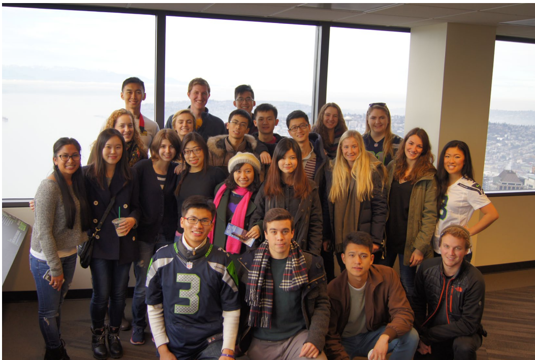
Foster School and Exchange Students on an in-city excursion

As an exchange student, you will be paired with a Foster Global Ambassador (FGA).