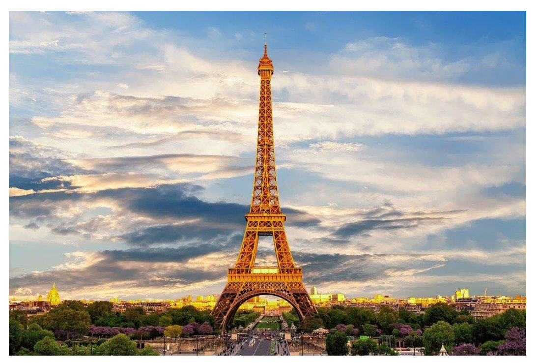
FRANCE - Ecole Supérieure de Commerce de Paris