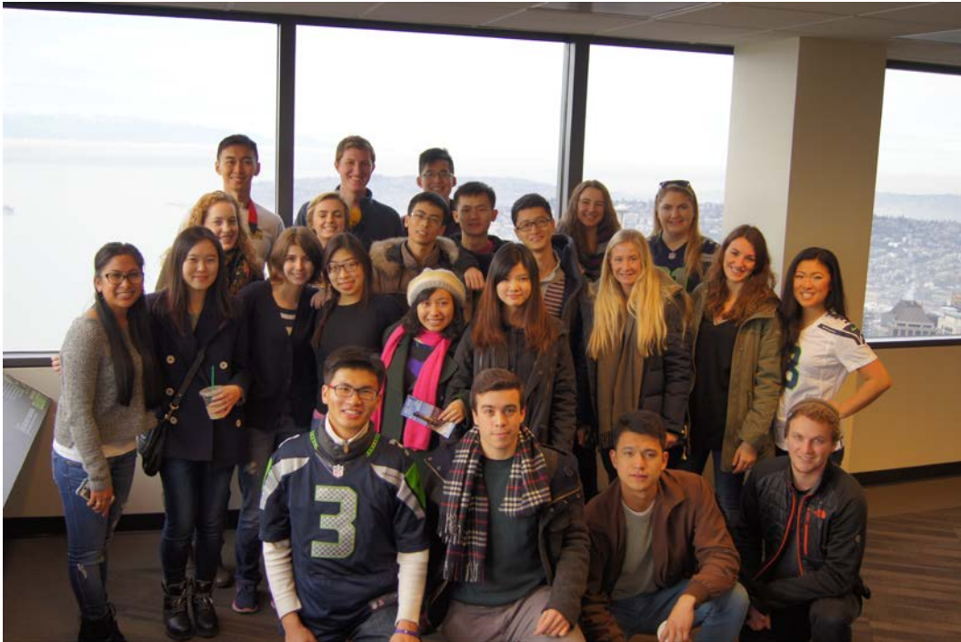
Foster School and Exchange Students on an in-city excursion

As an exchange student, you will be paired with a Foster School Global Social Ambassador (Buddy).