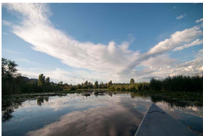
Lake Washington, Seattle

This interactive map can help you get acquainted with campus, and the greater Seattle area: http://www.washington.edu/maps/