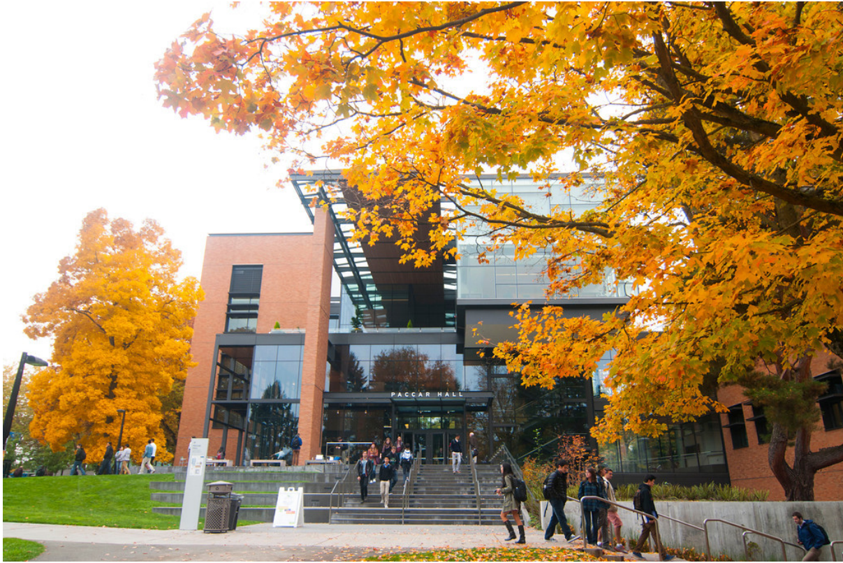
PACCAR Hall, home to the Foster School of Business