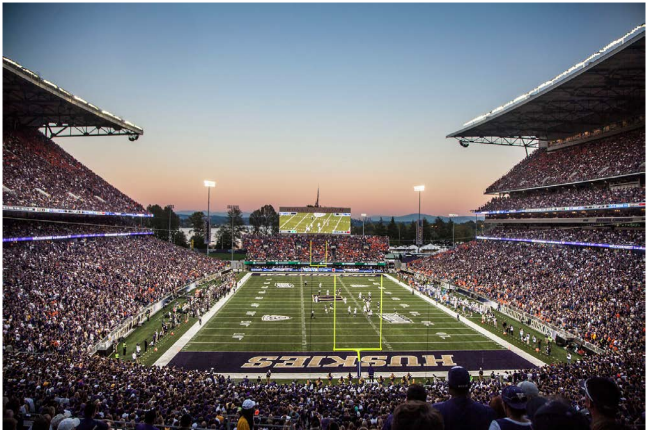
Husky Football Stadium