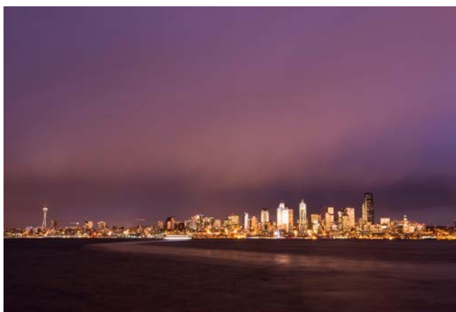
Seattle Skyline, from West Seattle