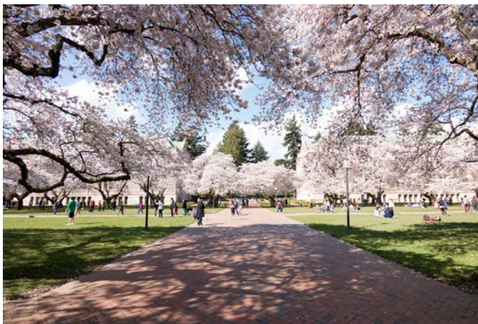
Cherry Blossoms at the UW Quad

Learn more about UW's Student Conduct Code .