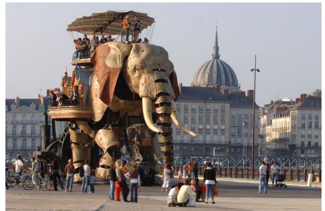
The Great Elephant