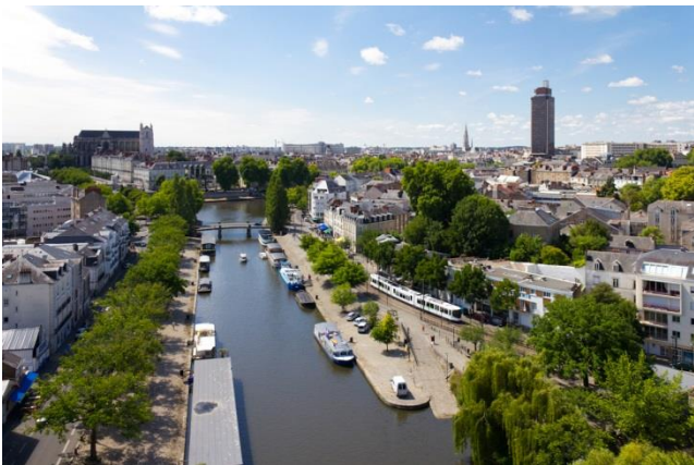
The Erdre river, Nantes