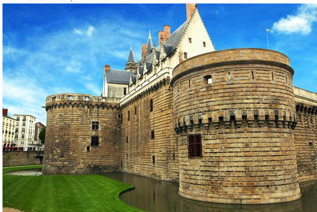
The Dukes of Brittany castle, in the city center of Nantes