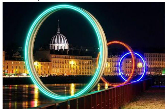
Nantes by night