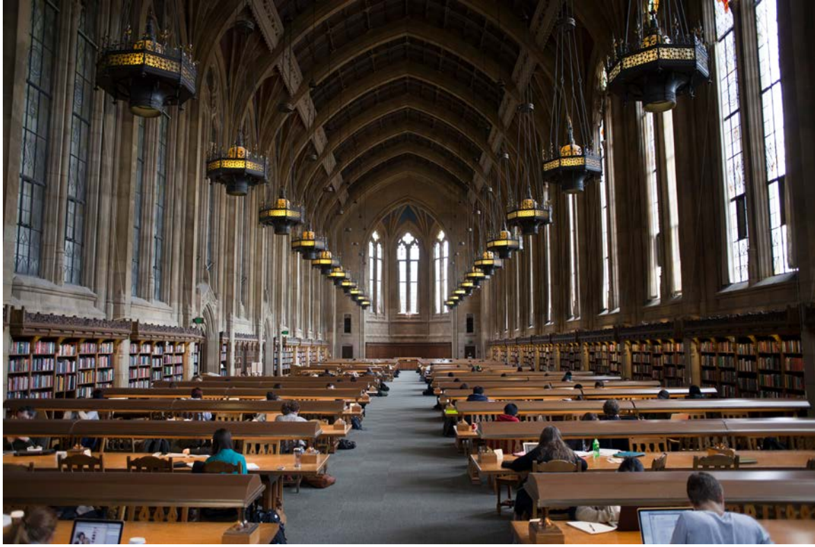
Suzzallo Library, University of Washington

The University of Washington is one of the world's preeminent public universities. Our impact on individuals, on our region, and on the world is profound — whether we are launching young people into a boundless future or confronting the grand challenges of our time through undaunted research and scholarship. Ranked number 10 in the world by Shanghai Jiao Tong University rankings and educating more than 54,000 students annually, University of Washington students and faculty work together to turn ideas into impact and in the process transform lives and our world.