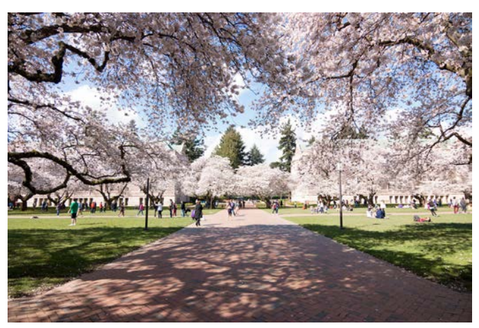
Cherry Blossoms at the UW Quad

Learn more about <u>UW's Student Conduct Code</u>.