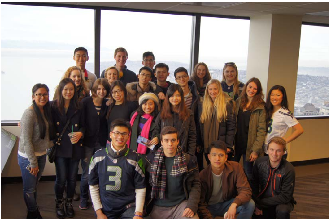
Foster School and Exchange Students on an in-city excursion

As an exchange student, you will be paired with a Foster School Global Social Ambassador (Buddy).