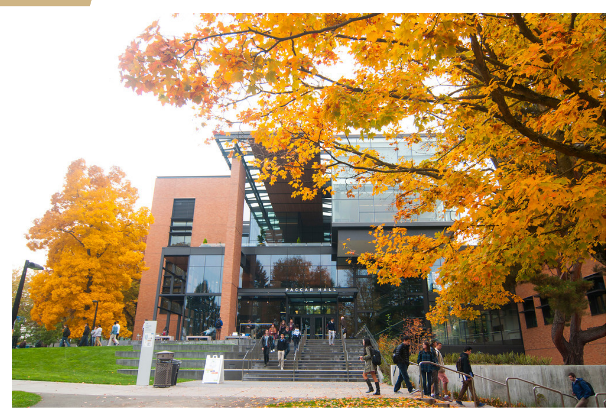
PACCAR Hall, home to the Foster School of Business